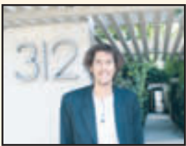
Local teen helps extinguish Elm Drive fire. 4