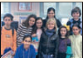
Beverly Vista Reflections winners celebrate. 4