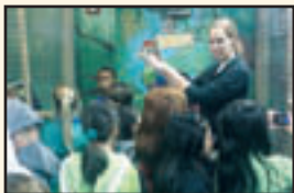
Beverly Vista students visit Culver City Eco Station. 5