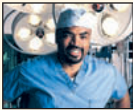
Local surgeon leads Haiti's Health Care recovery. NYNY4