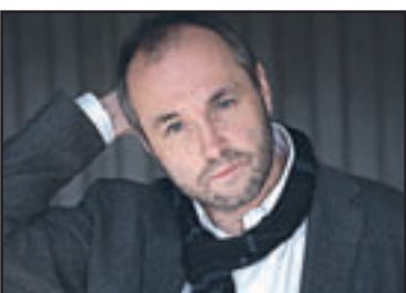
Author Colum McCann

"It's an exciting opportunity to have an intimate experi-